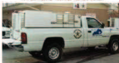
Slide In Units