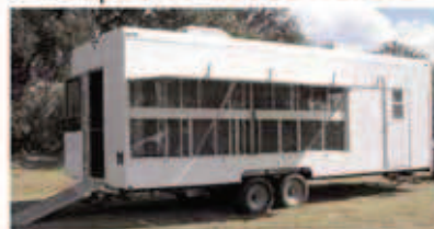
Trailers and Boxes